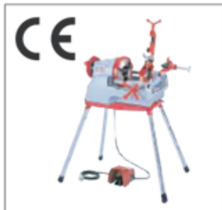
S80A for CE