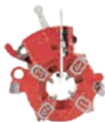
Uni-auto V die head [ for 1/2"~2" pipe ] S80AV/AVIII