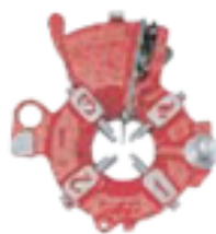
Self-opening die head [ for 2 1/2"~3" pipe ] S80AVIII