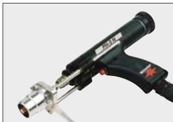
The PH-3N welding gun is the standard gun for the BMK-12W stud welder